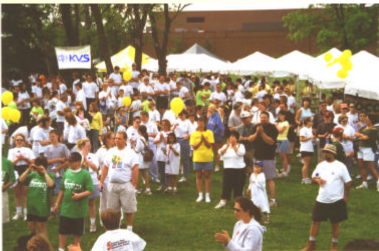
The 2001 Walk to Cure Diabetes draws a crowd of participants at the University at Buffalo Amherst campus.

This is the second year KVS has participated in the event which is held on various days across the country. Last year the walk raised a total of over $57 million for diabetes research.