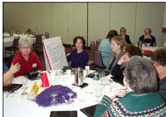
Pictured above is one of the many local KVS user group meetings held for our Southeastern clients, hosted by the City of Bowling Green, KY.

The Tri-State, Massachusetts and Colorado regional conferences will be scheduled for Fall 2003.