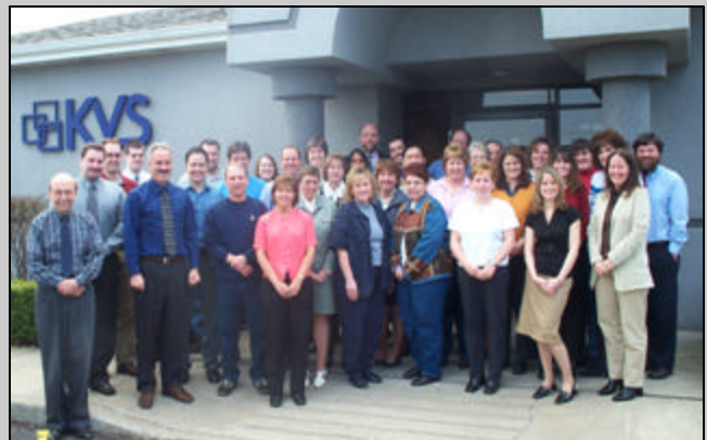
This year marks KVS’ 35th in business, and the staff now totals over 45. This photo of the majority of the employees was taken in March outside of KVS offices.